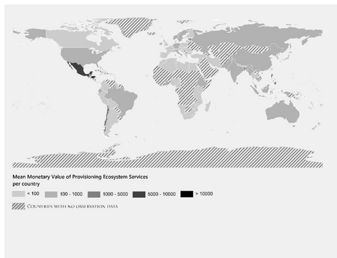
Panel A Value estimates for provisioning services

This finding reveals that some globally important forests, including the tropical rainforest in the Democratic Republic of Congo (the second largest rainforest, after the Brazilian Amazon), the boreal and temperate forests in Russia and Canada are not well represented in the literature. In addition, we found quite divergent estimated values for ecosystem services across countries.