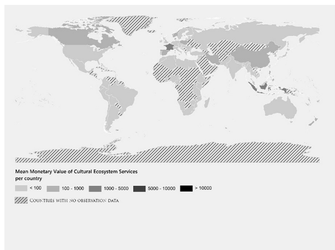
Panel C Value estimates for cultural service